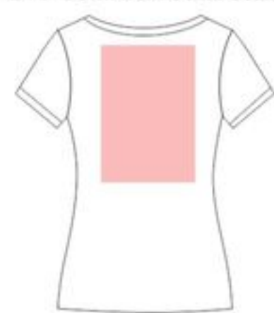
Women's Back Standard Size 10"x15" Standard Placement 2"-4" Down from Collar Seam