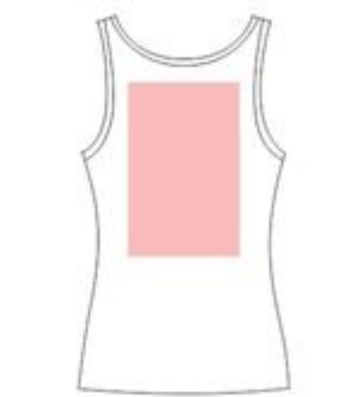
Tank Back Standard Size 9"x15" Standard Placement 2"-4" Down from Collar Seam