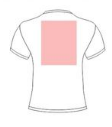
Youth Back Standard Size 10"x12" Standard Placement 2"-4" Down from Collar Seam