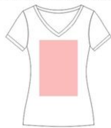
Women's Front Standard Size 10"x15" Standard Placement 2"-4" Down from Collar Seam