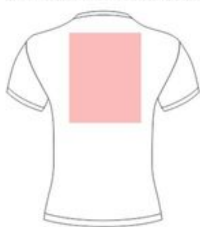
Adult Back Standard Size 12"x15" Standard Placement 2"-4" Down from Collar Seam