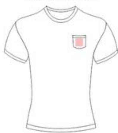
Pocket Print Standard Size 3"x3" Standard Placement Center of Pocket