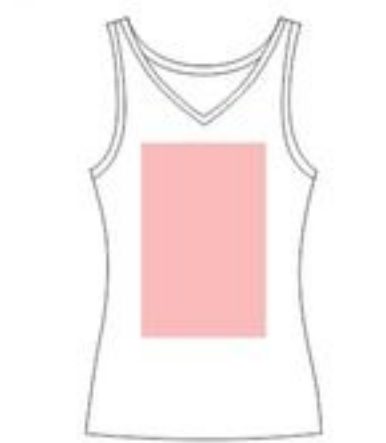
Tank Front Standard Size 9"x15" Standard Placement 2"-4" Down from Collar Seam