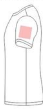
Short Sleeve Standard Size 3.5"x3.5" Standard Placement 0.5" up from Seam with 1" variance