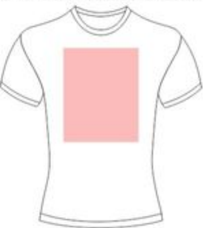
Adult Front Standard Size 12"x15" Standard Placement 2"-4" Down from Collar Seam