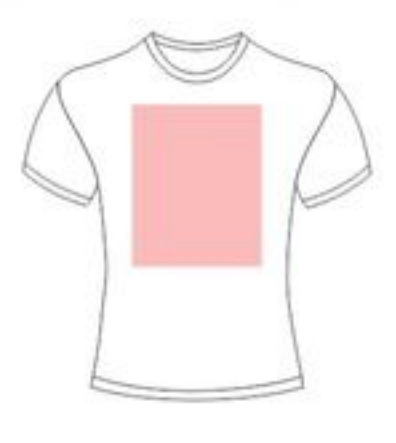
Youth Front Standard Size 10"x12" Standard Placement 2"-4" Down from Collar Seam